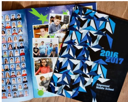
$16 Yearbook Only