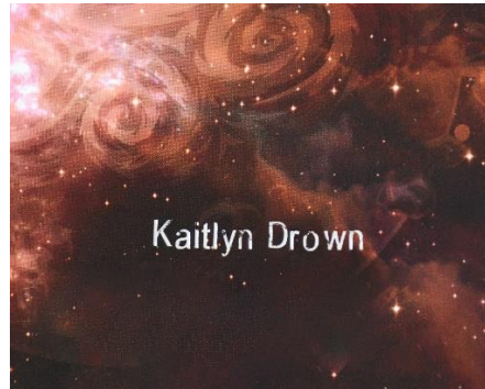
$22 Yearbook with Name

Order Online: vando.imagequix.com/g1001202044