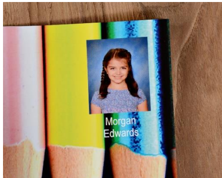
$24 Yearbook with Name & Photo